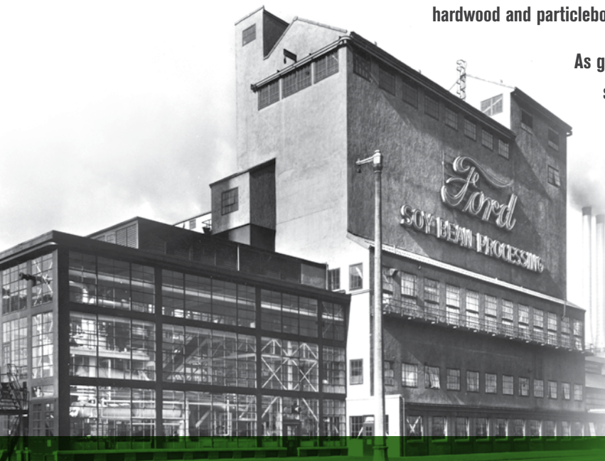
Ford Soybean Processing Plant at the River Rouge Complex

As global demand for fuels, fiber and material continues to climb, soy-based products and feedstock provide smart, sustainable alternatives to petrochemical-based products. With equal, or better performance, and lower environmental impact, soy-based products make it easy to go green. Think of all the ways you can save when you Think Soy.